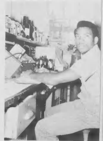
Willie C. Cornett Tech. - Laboratories